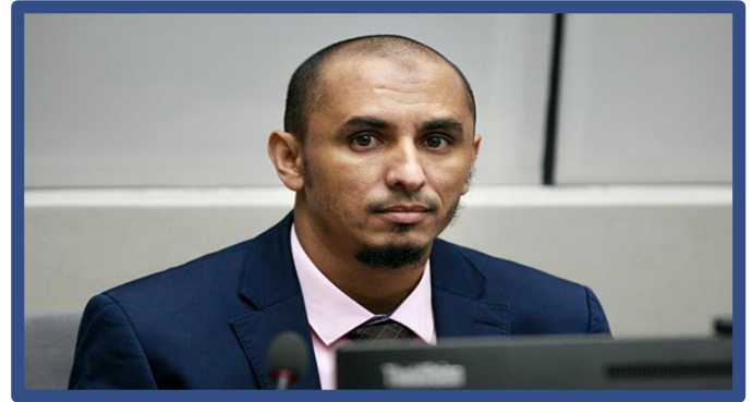
Al Hassan @ ICC

participation in the case by which, inter alia, it