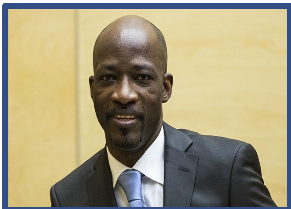
Blé Goudé

On 8 June, the Prosecution submitted the “Urgent Prosecution’s motion seeking clarification on the standard of a “no case to answer” motion” (ICC-02/11-01/15-1179), arguing, among others, that at this stage, and contrary to the views expressed by the Defence, the Chamber should not engage in a qualitative assessment of the evidence. In a 13 June decision (ICC-02/11-01/15-1182), the Single Judge rejected the Prosecution’s request, holding that ‘it is not necessary to take a position either as to the standards adopted by Trial Chamber V(a) or to the application of those principles in the final decision in that case’.