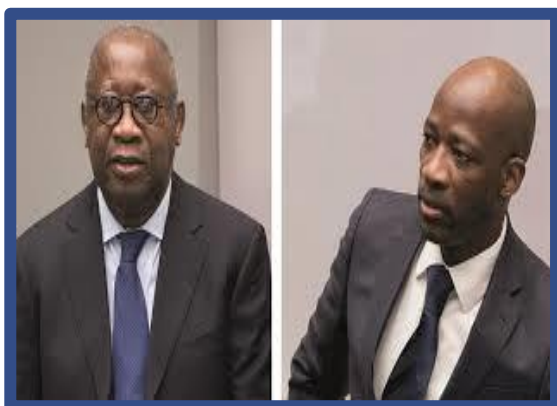
Gbagbo & Blé