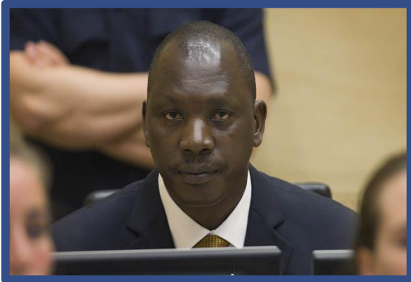
Lubanga @ ICC

Trial Chamber estimated the average value of harm suffered by each 425 victims at USD 8000. It also stated that 48 victims were ineligible for reparations.